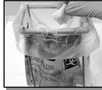
Performing the Test